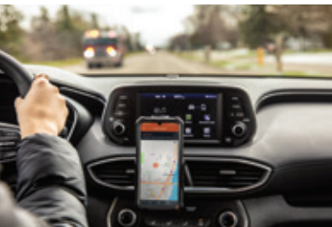
R2V – Waze mobile app alert