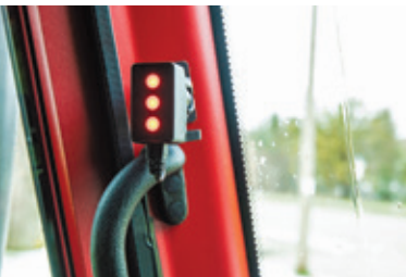
R2R – A-pillar lights