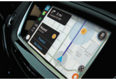
R2V – Vehicle infotainment screen